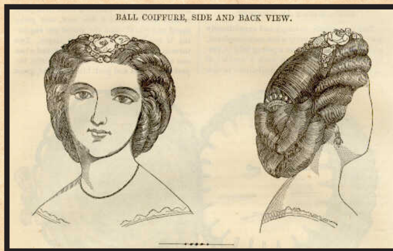
BALL COIFFURE, SIDE AND BACK VIEW.

DIAGRAM OF HALF OF THE WAISTBAND, SHOWING HOW IT IS ARRANGED AT THE BACK.